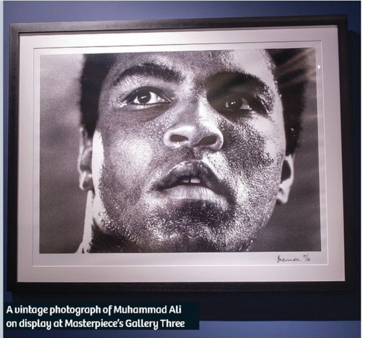
A vintage photograph of Muhammad Ali on display at Masterpiece's Gallery Three

At: Masterpiece Fine Art, Wafi City, Dubai; until 31 Jan, 2022