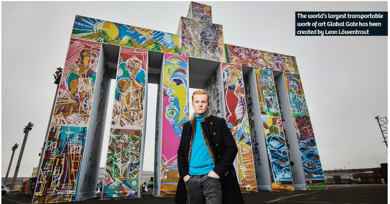
The world's largest transportable work of art Global Gate has been created by Leon Löwentraut