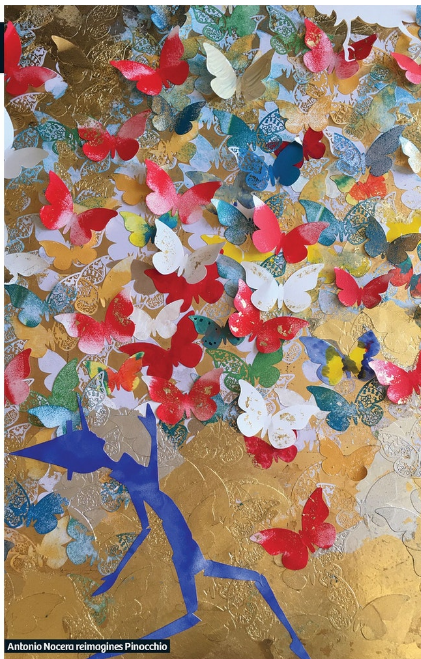
Antonio Nocera reimagines Pinocchio

At: Oblong Contemporary Gallery, Dubai; until January 31, 2022