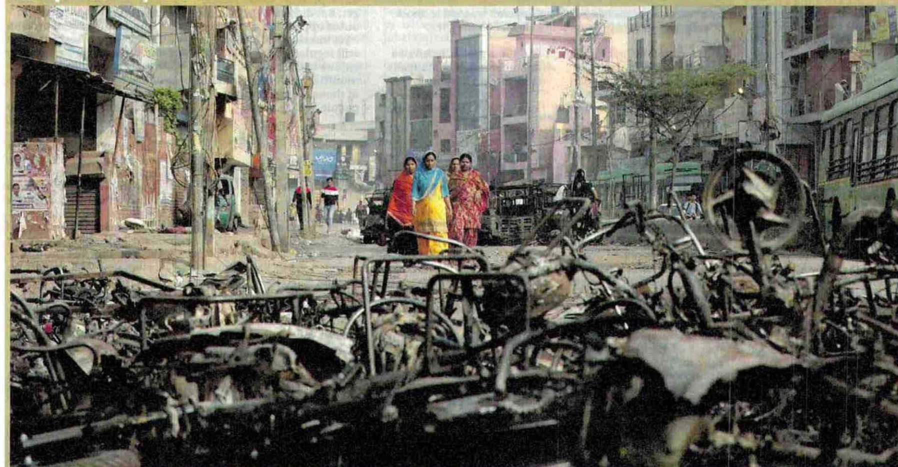
The aftermath in a riot-affected area of New Delhi yesterday after clashes between people demonstrating for and against a new citizenship law. Report, page 11