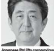
Japanese PM lifts coronavirus emergency in all remaining areas Page 13