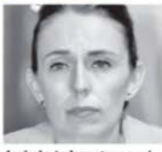
Jacinda Ardern stays cool as quake hits mid-tier event Page 9

"Today we are reaping the fruits of the vision of our wise leadership, which has been instrumental in the success of our efforts to contain the spread of the virus and mitigate its repercussions," Sheikh Mansour said.