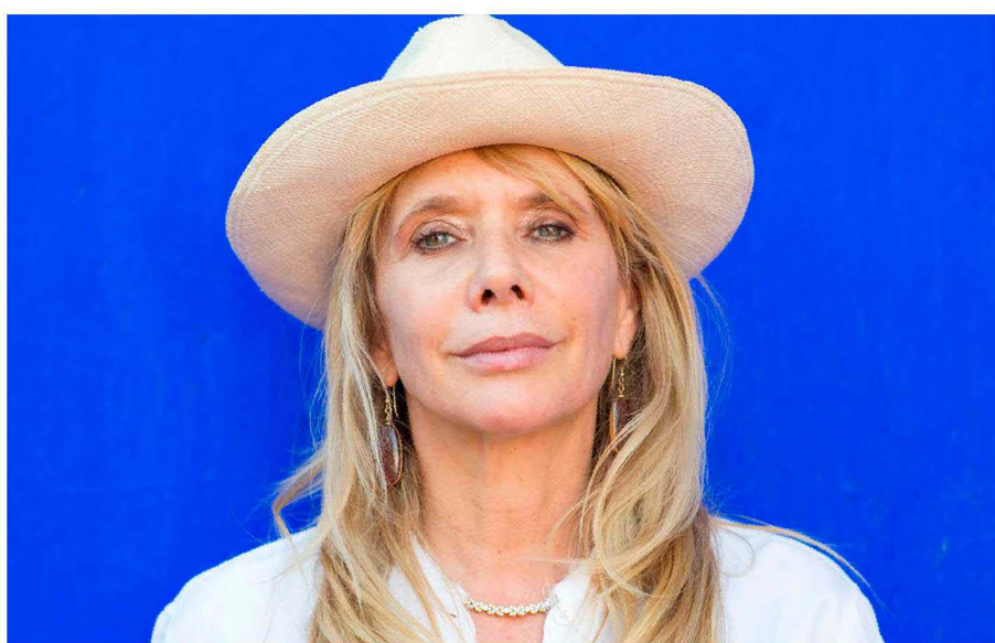
➔ Rosanna Arquette poses for a portrait session during the luncheon honouring director Agnes Varda at the Residence de France, in Beverly Hills, California.