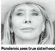
Pandemic sees true sisterhood emerge: Rosanna Arquette Page 94