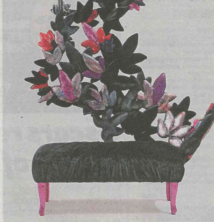
'Black Grapes Leaves'.

Another design has a pod of playful dolphins riding the waves on the back of a pouffe. Other chair sculptures have been created with sequined crescent moons in silver, gold, and bright colours. Her most popular series includes sofas, pouffes, divans and chairs shaped like roses. Tolomeo often uses vintage fabrics and embroideries, incorporating memories of the past into her contemporary designs.