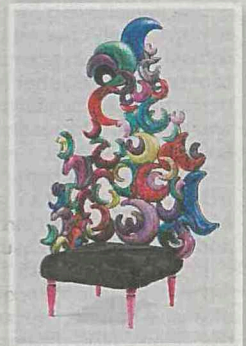
Top: 'Le Palmares'. Below: 'Moons Dream'.