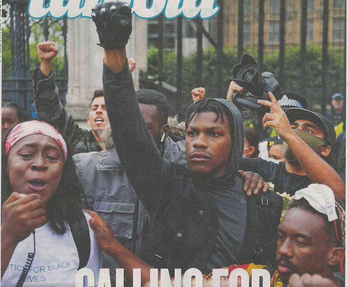
John Boyega during an anti-racism demonstration in London.